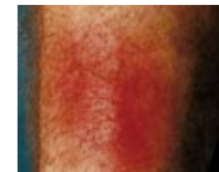
Classic examples of the variety of rashes which may accompany early Lyme Disease.

A typical early symptom of Lyme Disease is a slowly expanding red rash at the site of the tick bite. The rash usually appears within a week to a month after the bite and can slowly expand over several days.