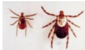
Adult Female Ticks: Ixodes (Deer Tick) - left and Demacentor (Dog Tick) - right Ticks shown approximately three times actual size

In the United States, two closely related tick species – Ixodes scapularis and Ixodes pacificus – have been identified as harboring and transmitting the Lyme Disease-causing Borrelia and Ehrlichia bacteria and Babesia protozoan to people and animals. I. scapularis , the black-legged tick, is found in the eastern U.S., and I. pacificus , the western black-legged tick, is on the West Coast. Keep in mind that Ixodes species are smaller than the common American "dog tick," which does not transmit the Lyme Disease causing spirochetes but can transmit the agent of Rocky Mountain spotted fever.