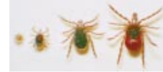
Four Forms: of the Ixodes tick – larva, nymph, adult male, and adult female are shown approximately four times actual size

Most people do not feel a tick biting, nor the subsequent drawing of blood the tick needs for nourishment. If left undisturbed, the tick will remain attached to its host and become engorged with blood over the next 2-4 days. While fully engorged, the tick drops off the host. If the Ixodes tick happens to be a carrier of the Borrelia spirochetes, or other disease-causing organisms, it may transmit them to the host during this feeding process. Once in your body, the spirochetes can multiply. Not all ticks carry a disease-causing organism, and a bite does not always result in the development of disease – even if a tick is a carrier.